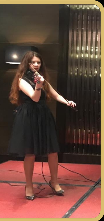
THE OBEROI, GURGAON