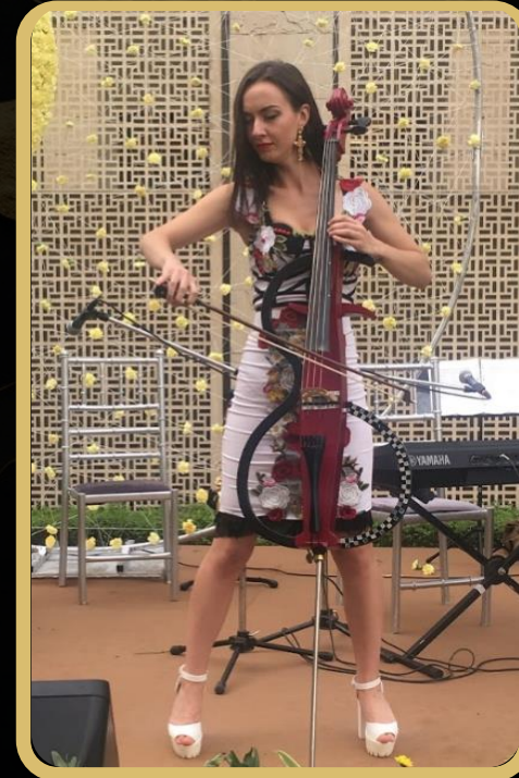
THE LODHI, NEW DELHI