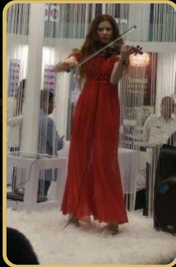
PRAGATI MAIDAN, NEW DELHI