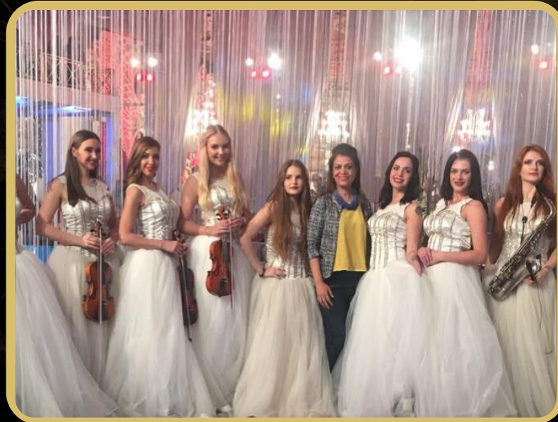
THE UMRAO, NEW DELHI