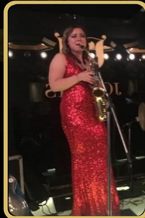
THE CHANAKYA MALL, NEW DELHI