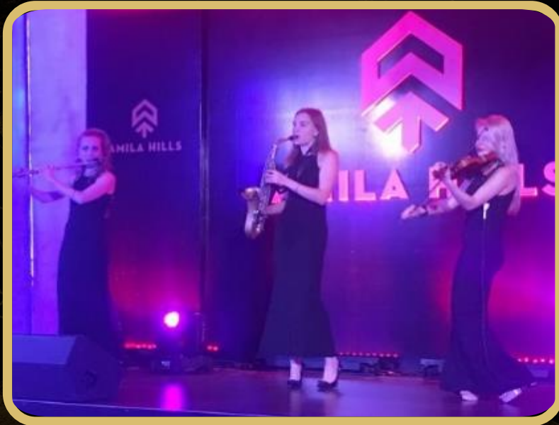
THE OBEROI, NEW DELHI