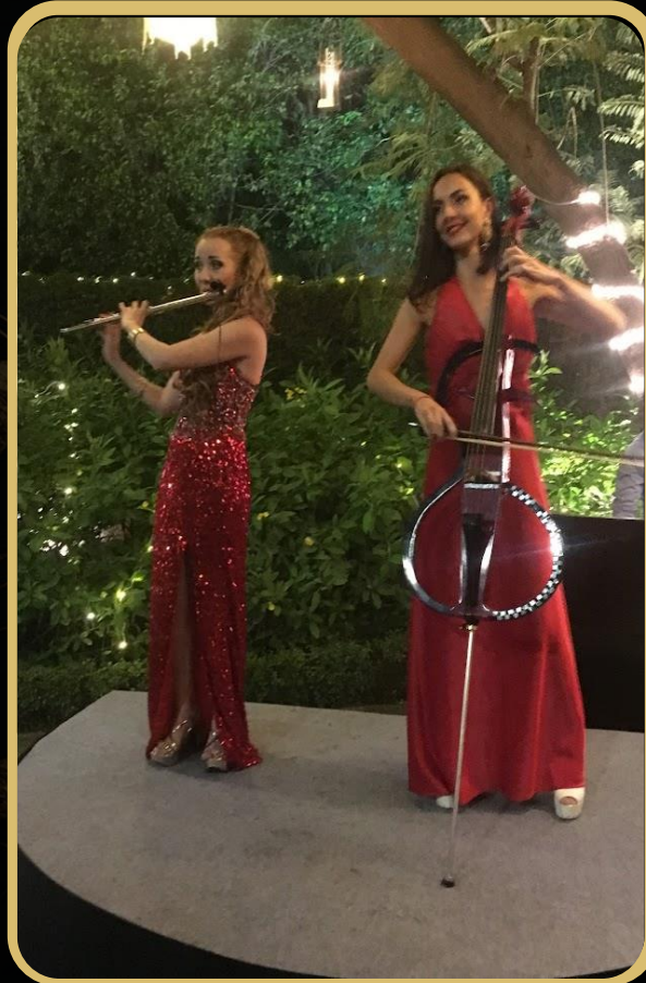
TRIDENT HOTEL, GURGAON