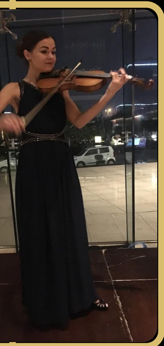
THE WESTIN, GURGAON